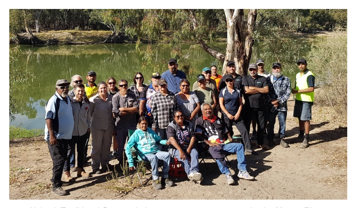
Ngintait Traditional Owners during a waterway assessment by the Murray River

We love sharing stories and updates about MLDRIN's work to advance Aboriginal water rights across the Southern Murray Darling Basin! We acknowledge the Elders and Traditional Owners who are working across the region to protect and restore our sacred rivers. If you would like to submit info or stories for the next MLDRIN news email <a href="mailto:eo@mldrin.org.au">eo@mldrin.org.au</a>